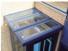
Ceiling (metal sheet or glass)