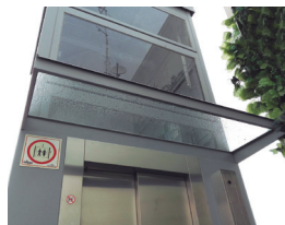
Roof over door (metal sheet or glass)